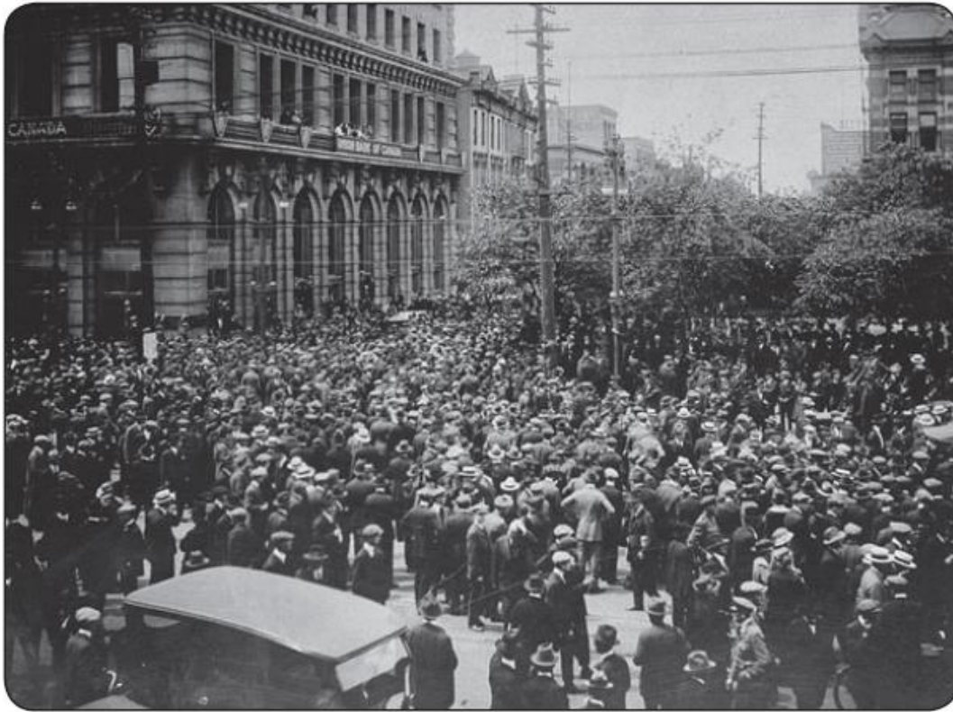
Winnipeg General Strike, June 1919