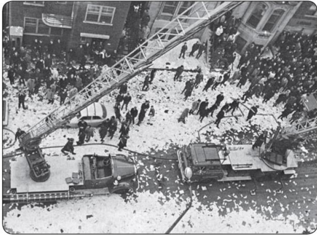
Sir George Williams Riot, Montreal, 1969