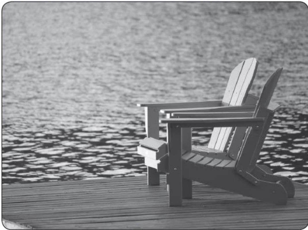
Summer on the Lake