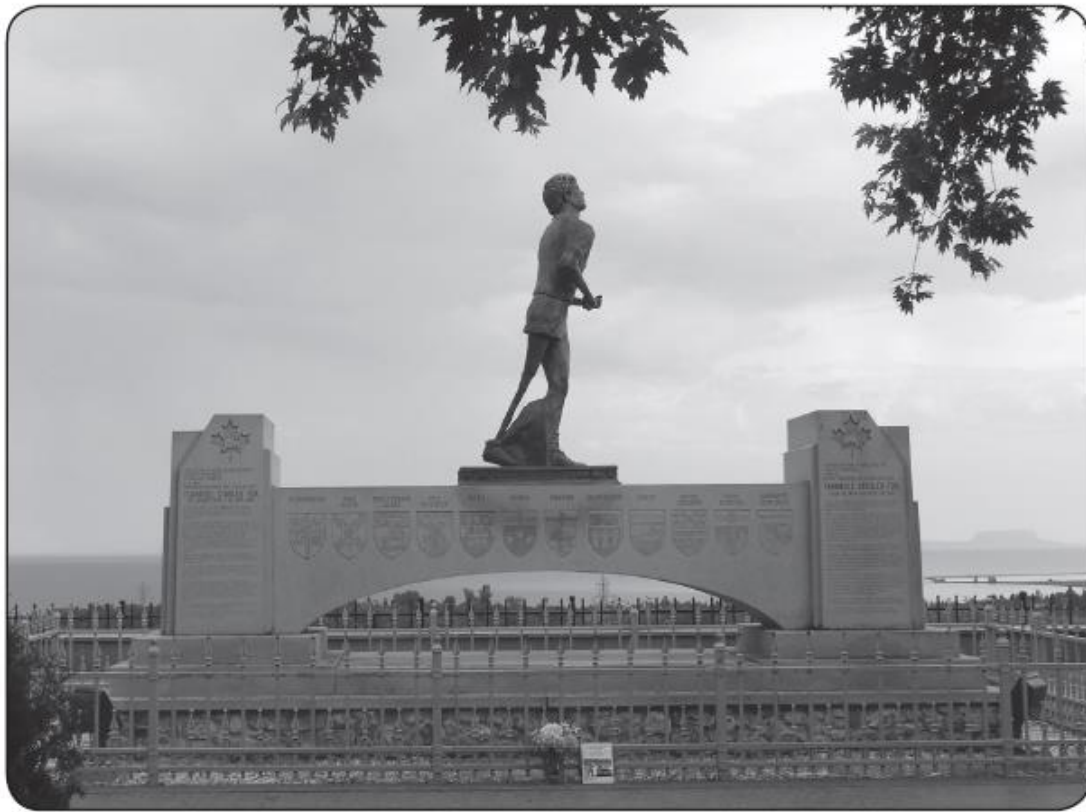
Terry Fox Memorial, Thunder Bay