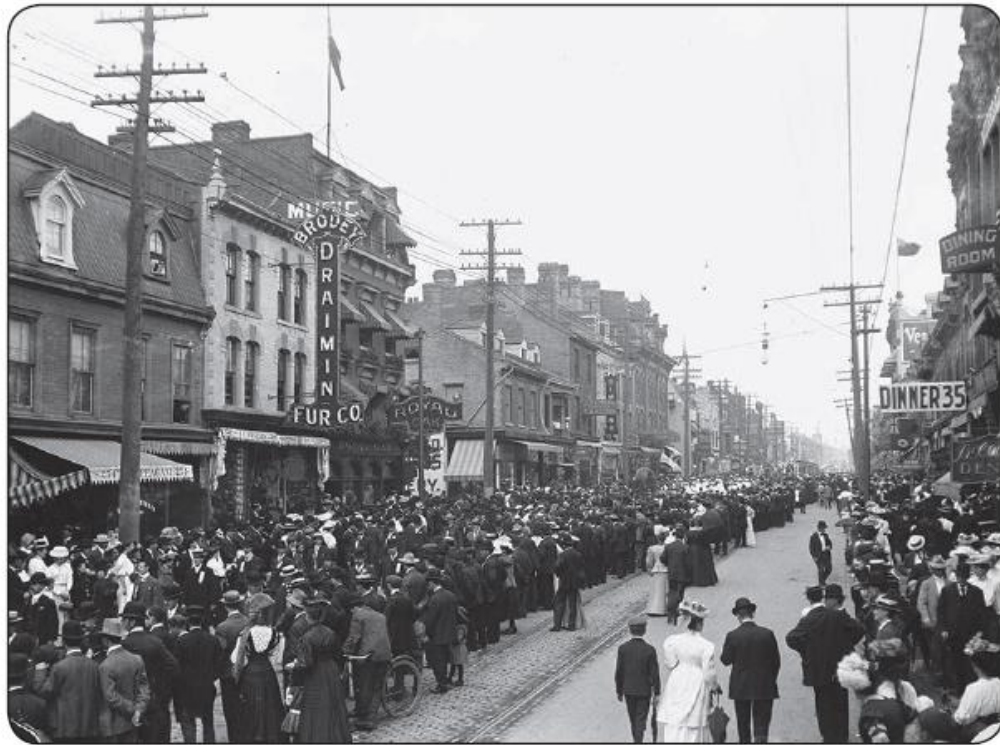
Labour Day Parade, Toronto, 1900s