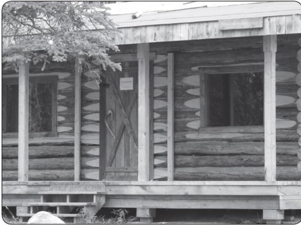
Teslin Tlingit Cultural Centre cabin, Yukon